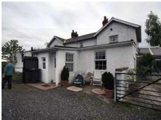
Duffield Gate station house in May 2010