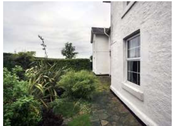
Duffield Gate station in May 2010