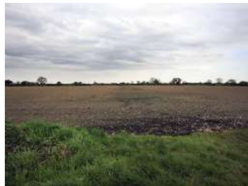
Looking east from Duffield Gate level crossing in May 2010